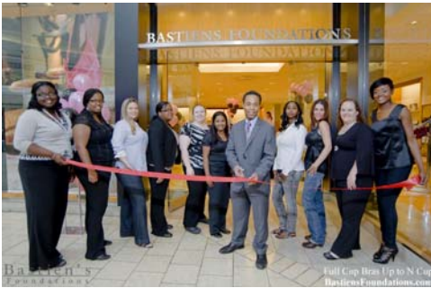
Pictured above: Bastien's Foundations celebrated their grand opening on May 29 with a ribbon cutting and receipt of a proclamation from the City of Gaithersburg Mayor Sidney Katz.

For more information about MC311, call the Office of Public Information at 240-777-6507 or visit www.montgomerycountymd.gov/311 .